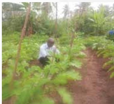
Images: Agro-Business Projects in Mtwara

Within the community catchment areas ATS Tanzania has focused on agricultural supplier development and skills development on local farmers and small business owners. Prior to ATS's involvement it was observed that small scale farmers within the client's catchment zones were not transitioning from subsistence to commercial farming, and this had affected the farmers means of support. The ATS Legacy Program adopted a practical methodology which used sustainable strategies designed to integrate better ideas and services needed to increase productivity and improve resilience of the low-resource farmer in Mtwara and its surrounding communities within Tanzania.