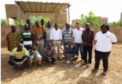
Images of the Solar water pump as well as local community leaders, ATS staff and the Municipal Councilor of Perkoa.