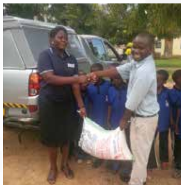
Images: ATS donating items to the EAGT orphanage at Mtwara